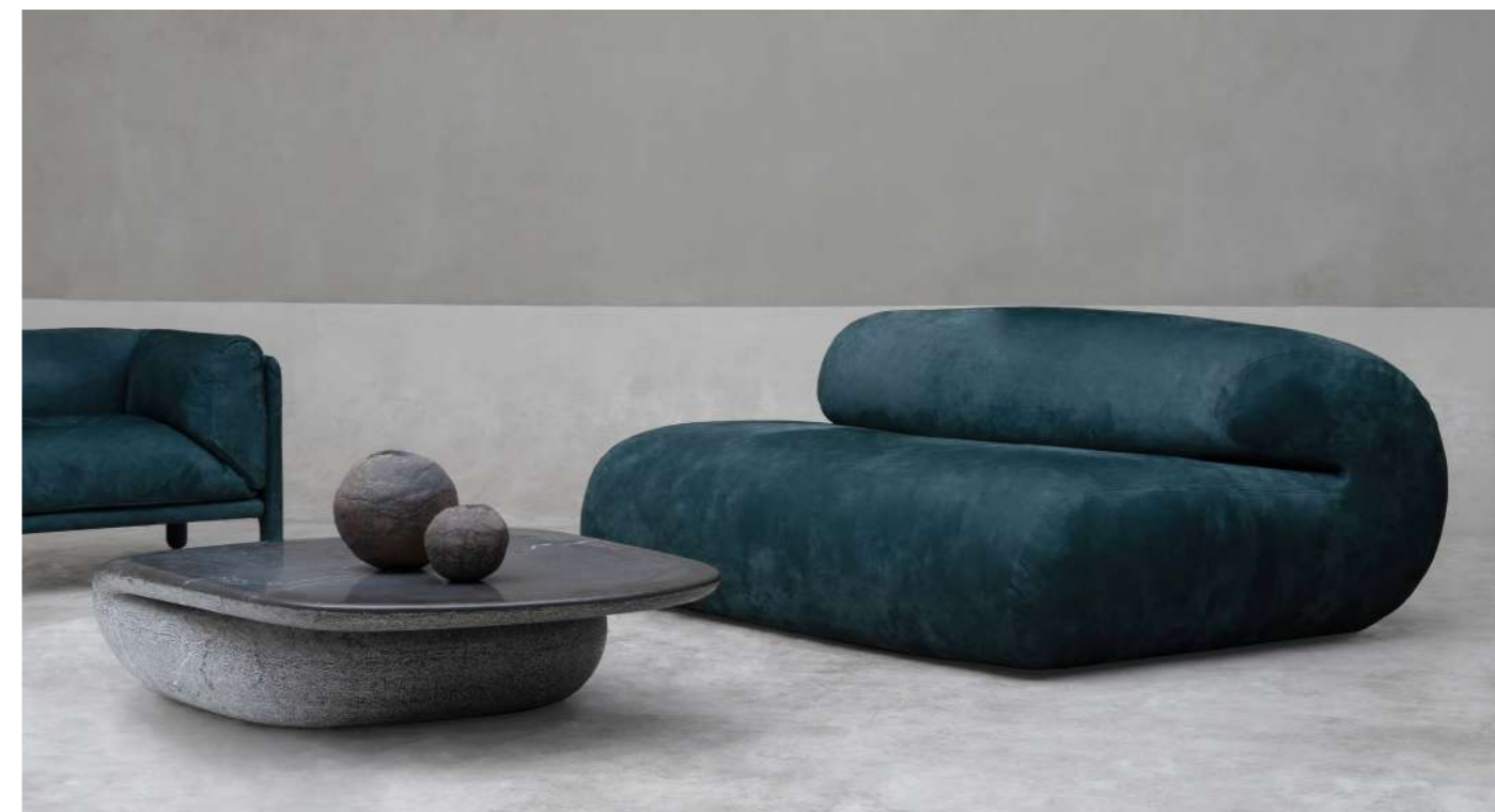
Kairos Leather Ardesia