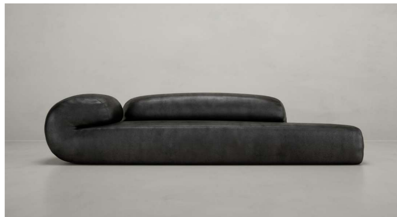
Divina Leather 702